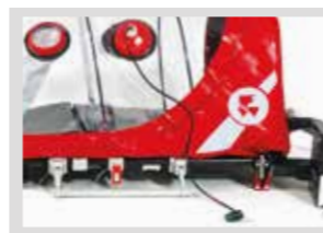
WATERPROOF CABLE GLAND FOR MONITOR