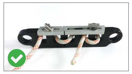
In case of heavy load, lock completely the system.

Return the gates to the locked position, covering all friction holes, and fasten by tightening the lock nuts.