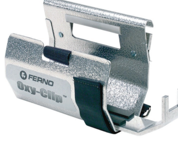
Oxy-Clip Oxygen Cylinder Holder