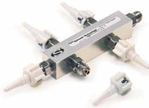
Oxygen Supply Hoses Sold Separately