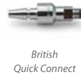
British Quick Connect