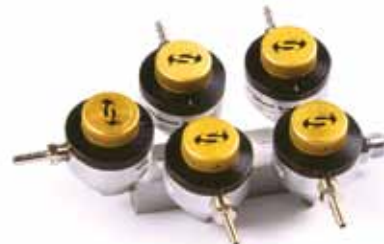
Oxygen Supply Hoses Sold Separately

Model 905 Mini-Manager O 2 Administrator™ ..... #0819585