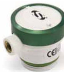
Three Adaptors Included